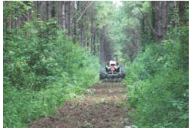
Light strip-disking along a thinned pine plantation row.