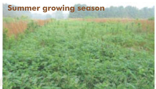
Summer growing season

In stands of introduced grasses, interseeding white clover can enhance the stand for some species of wildlife. Clover provides quality forage for wildlife such as deer and rabbits. During spring and summer, clover stands may also provide insect rich foraging areas for birds. Clover should be interseeded into established stands of introduced grasses in a strip fashion on one-third to one-quarter of the acreage. Cost-shares for interseeding perennial legumes cannot exceed $50 per acre.