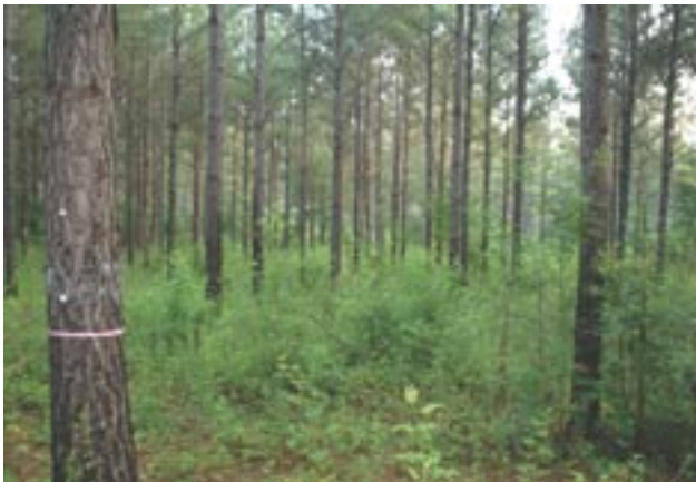
CP11 pine plantation following thinning, burning, and selective herbicide.

Light strip-disking is limited to one-third of forest openings or one-third of rows between mid-rotation aged pines per year. Woodland strip-disking is not as efficient as prescribed fire, but can be an effective tool for early successional habitat management where prescribed fire is not an option. Take care not to disk too deeply, which could injure tree roots, or otherwise damage trees with equipment. Currently, the average cost of disking is about $18/acre.