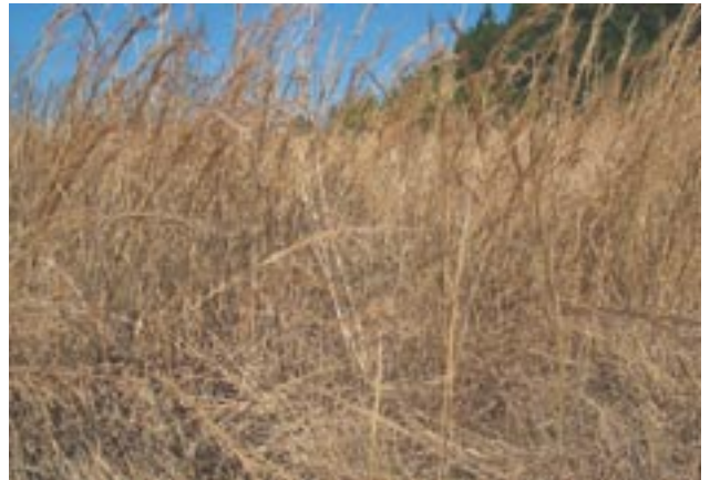
Grass-bound CP10 field dominated by perennial grass. Prescribed fire or light disking would improve the plant community for a number of grassland wildlife species.

In contrast, the annual weed communities produced by periodic soil disturbance provide essential resources for quail and other early successional species of wildlife. Annual weed communities are characterized by grasses and forbs (especially legumes) that occur following some form of soil disturbance. Some examples of annual plants include ragweed, partridge pea, and panic grasses. These annual plants produce an abundance of seeds used by many birds and mammals. Annual plant communities also support diverse insect communities that provide critical nutrients for nesting birds and growing chicks.