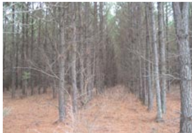
Unthinned CP11 pine plantation with little herbaceous ground cover provides poor wildlife habitat. These stands should be thinned when trees are merchantable.

Thinning woodland stands opens the forest canopy and allows sunlight to reach the forest floor, stimulating development of a grass/forb ground cover and enhancing wildlife habitat value of the stand. Thinning prescriptions should be based on landowner objectives. Heavier thinning is better for grassland wildlife (such as quail) habitat, but the first thinning of CRP pines must leave at least 200 trees per acre. A registered forester can assist you with developing a forest management plan and marketing merchantable timber. Timber thinning cannot be cost-shared, but thinning merchantable timber will usually produce some revenue while improving the structure and growth of the remaining timber stand. During the year of thinning, annual CRP rental payments will not be paid on thinned CRP acres.