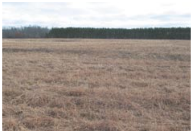
Annual mowing eliminates potential winter cover and nesting cover for the following season. Additionally mowing produces a dense litter layer that impedes movement of ground-foraging wildlife such as bobwhite quail.